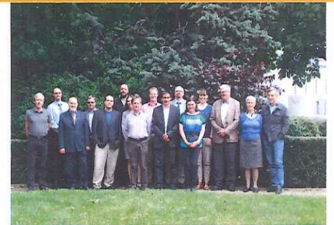
EAN steering group (May 2012)